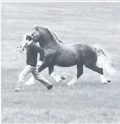
Blaengwen Brenin on the move