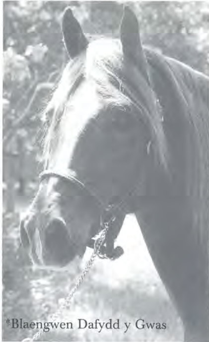
*Blaengwen Dafydd y Gwas

lion, Glannant Epic (33 years old). He is the oldest active Welsh stallion in the U.S. and the U.K.. Parc Welsh Flyer, grandsire of our Delight had been their oldest, but he has now passed away.