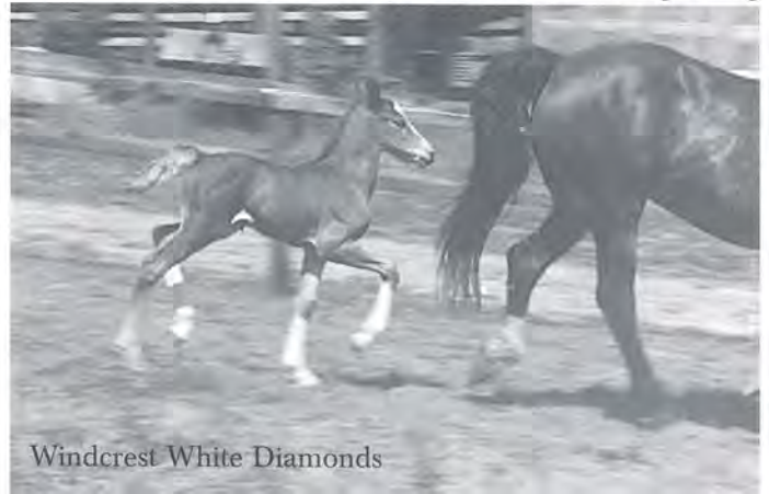
Windcrest White Diamonds