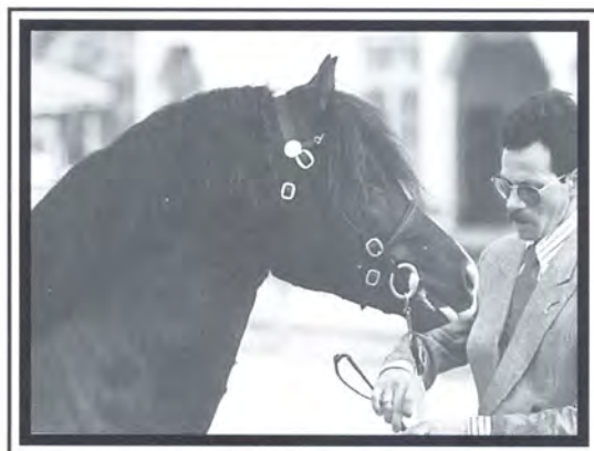
Pictured at American Nationals-1996 4U2C

Black, 13.0 1/2 hands, Section C $700.00 US Funds L.F.G ( live cover / hand breeding )