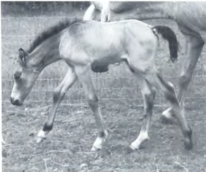
photo at 2 days old