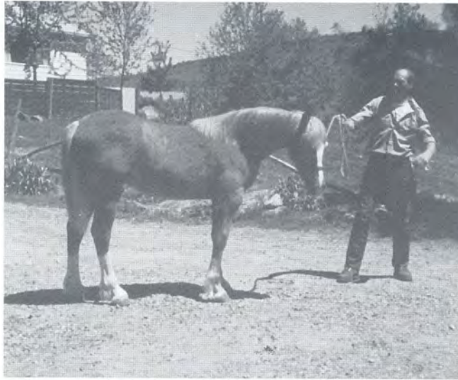
Parc Maureen arrives in Lyme, NH. 1986