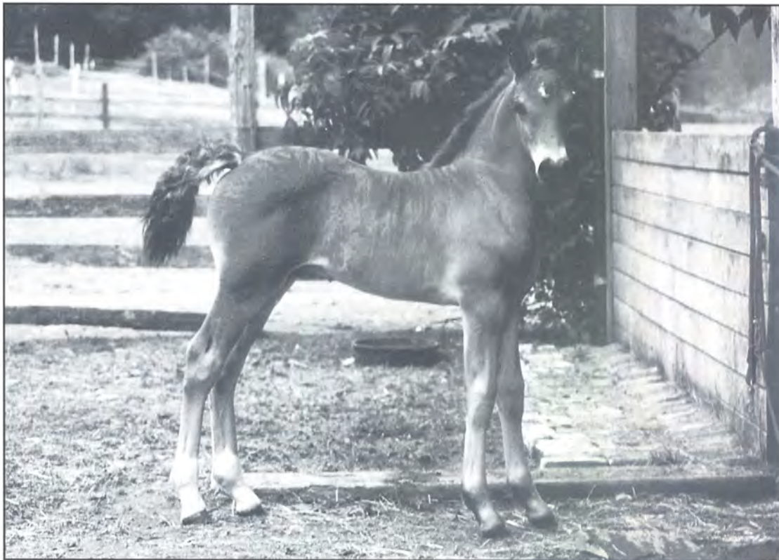
North Fork's Royal Victor (Canterbrooks Llwynog Ddu x Hastening Mirage)