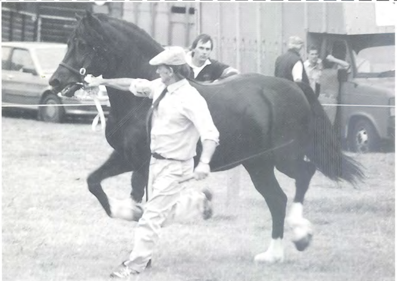
Geler Dago Ystrad Dewi Victor x Geler Sali x Parc Welsh Flyer see inside, page 16 for details on Dago