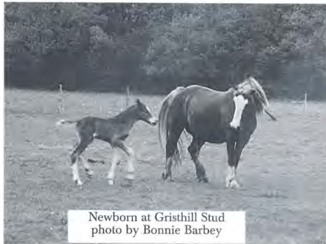
Newborn at Gristhill Stud

The foal should emerge from the sack during the delivery process or as soon as it hits the ground. The foal can quickly suffocate if the sack is not ruptured. If you find the foal in the sack, rip it near the face of the foal and wipe its nose and sweep the mouth and stimulate its chest. A sort of equine CPR can be done if you hold the muzzle shut and breath through the nostril. Vigorous chest rubbing can stimulate the foal. (editor: an inexpensive foal recusitator can be obtained through many avenues and left hanging in the barn. Make sure that you and your workers know how to use it properly, as an emergency is no time to read instructions.)