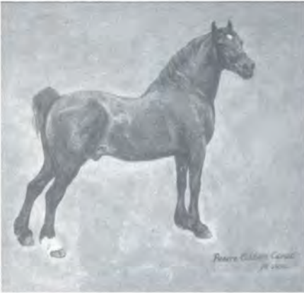
painting of the late Pentre Eiddwen Comet. Royal Welsh Ch. '51,'53, '56-'59. Sire of Parc Welsh Flyer, Nebo Black Magic, Tyhen Comet, Llanarth Flying Comet, etc...