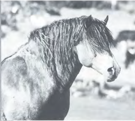
Mabnesscliffe Survivor (Craignant Flyer x Hewid Wendy x Hewid Cardi) Sire of *Nesscliffe Sunrise