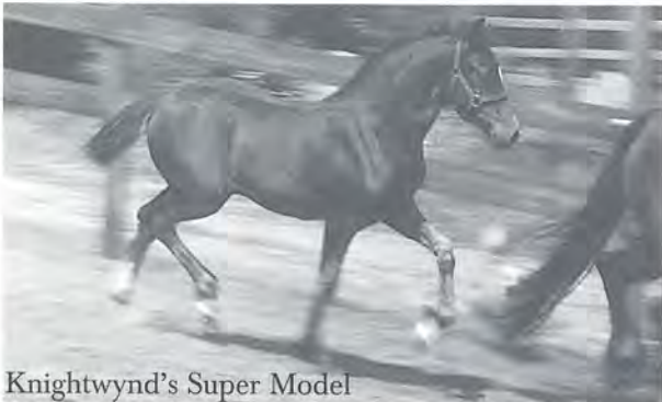
Knightwynd's Super Model

In the Wisconsin-Illinois stateline area we have had a